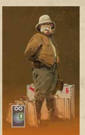
PERMANENT The Belgian crew draws at least 2 cards when entering a city.