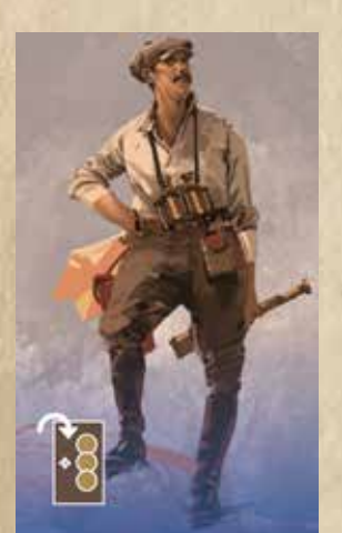
ONCE PER TURN draw 3 TERRAIN TILES and place them on the board.

How it works: The power of each Leader acts at a specific point in the game. Some powers can only be used once per GAME TURN, while others are permanent. After using a GAME TURN power, flip the Leader card over to its neutral side. At the beginning of each new GAME TURN, flip your Leader card back to its active side.