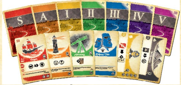
67 X CIVILIZATION CARDS