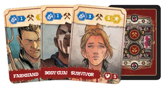
40 Job Cards