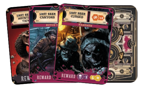
14 Most Wanted Bounties