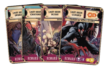
4 Wanted Bounties