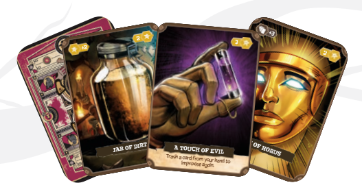
12 Artifact Cards & Tokens