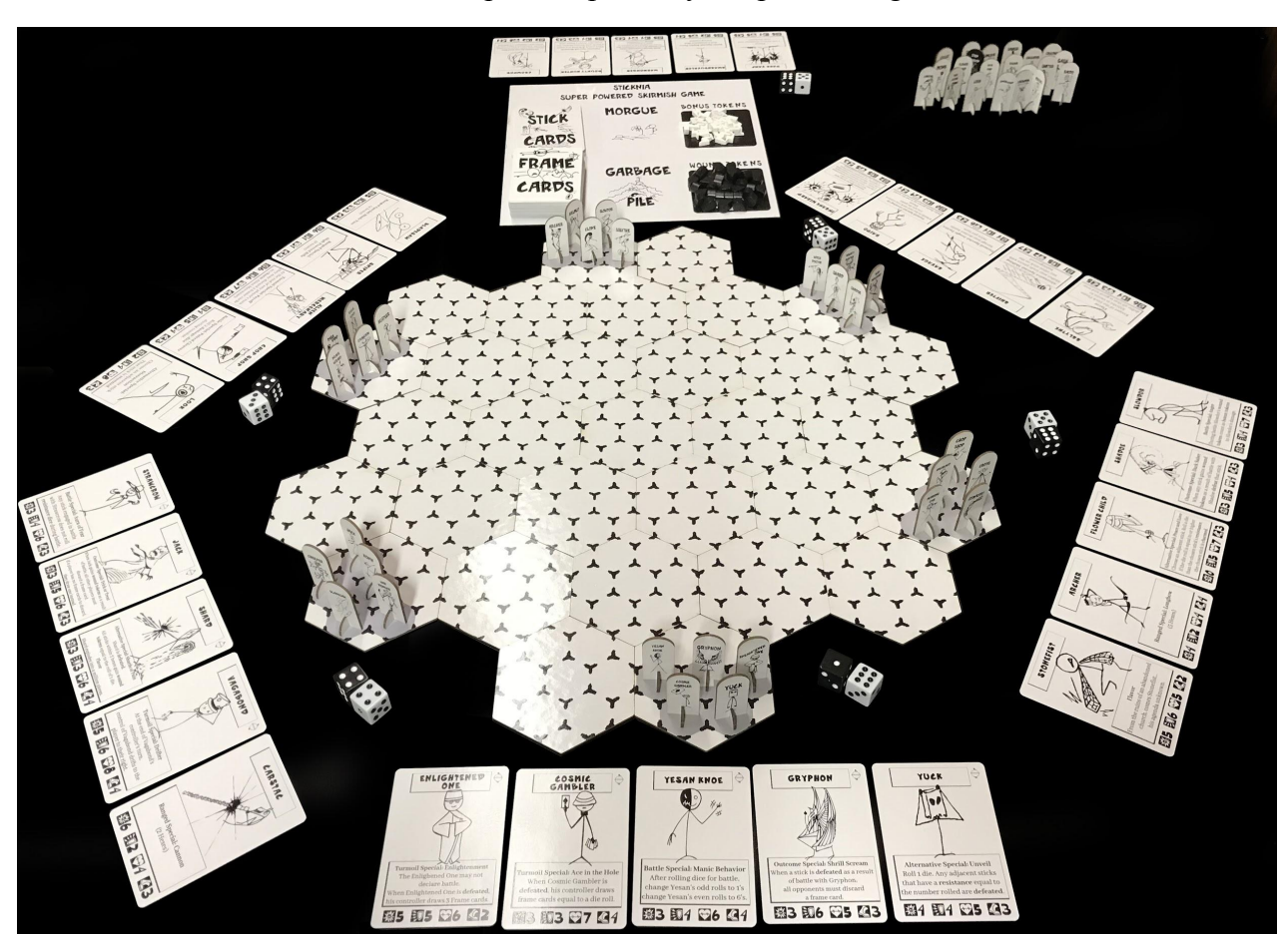
Example Setup: 6 Player Open Battleground