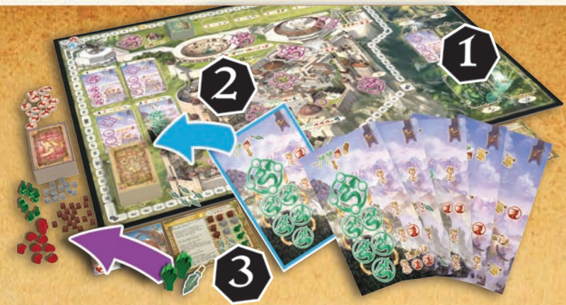
Example 1: End of the player's turn.