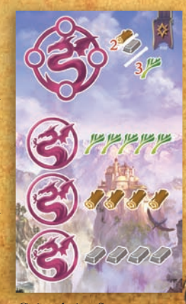
Gain: Action Spaces

1. Gain: Action Spaces with any resource or tile symbols allow the occupying player to take resources depicted and place them in their playing area.