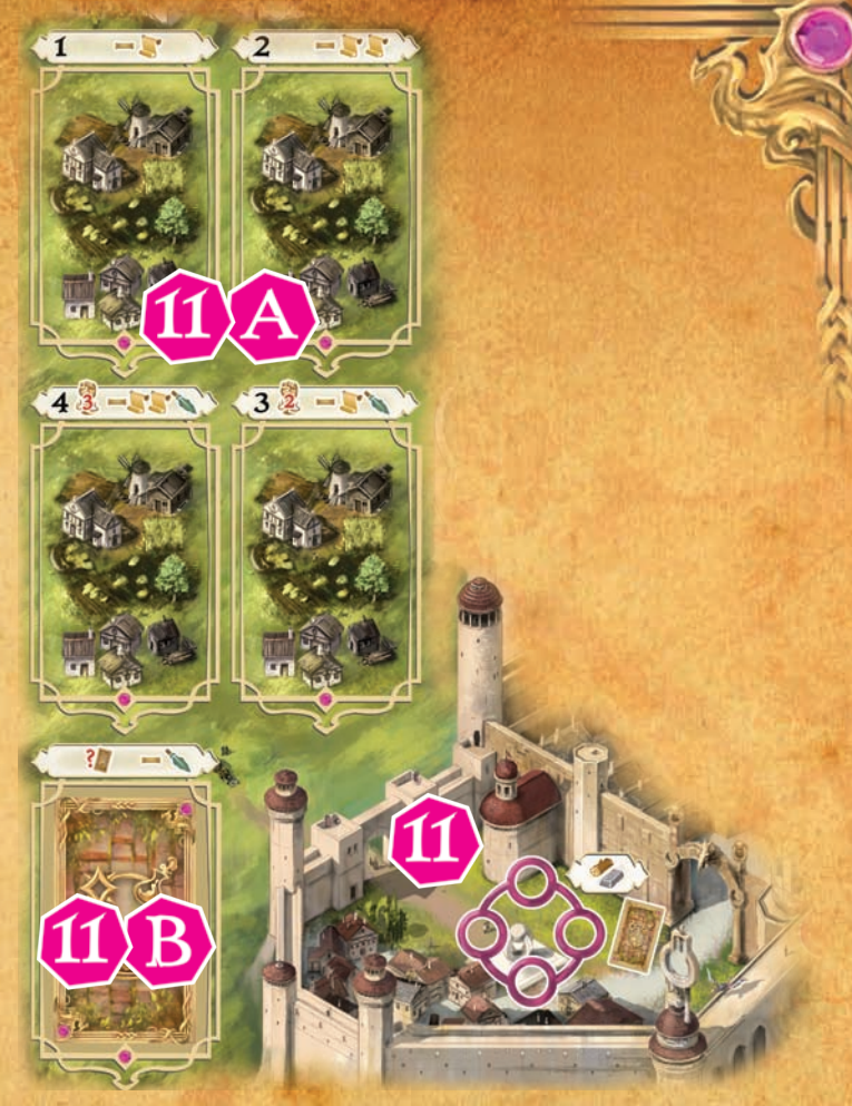
City Action Spaces: Scout Quarters

12. Dragonlord Statue (multiple Dragonriders): player draws 3 Objective Tiles from the stack (for detailed information on Objective Tiles go to page 16). The player may examine the tiles and choose 1 or none of those tiles to place on any empty