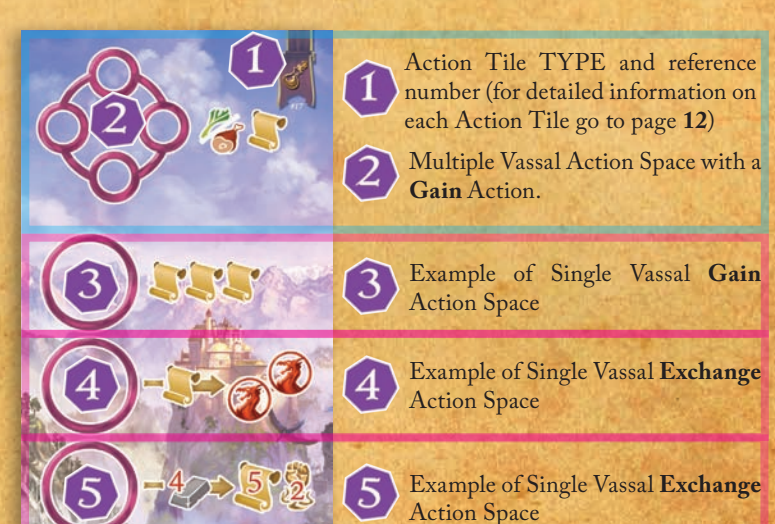
Example of an Action Tile