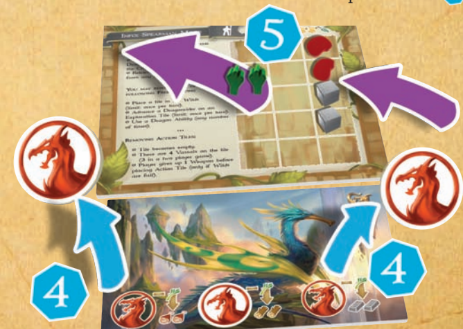
Free Action example: Using Dragon Abilities

Use a Dragon Ability: to resolve this Free Action a player removes an Ability marker 4 from any Dragon Tile in their play area and immediately resolve the Dragon Ability it was placed over.