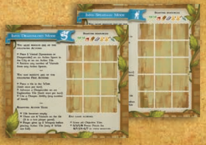
Player Board with 12 and 15 resource slots

resource tokens ( 3 12 in Dragonlord Mode). This number corresponds to the number of Resource Slots on a player board, so any resource token a player is unable to keep in an empty slot is discarded.