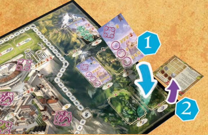
Free Action example: Placing Action Tile in the Wilds

On their turn – before, during, or after resolving the effect of an Action Space – a player may resolve, in any order, each of the following Free Actions once per turn: