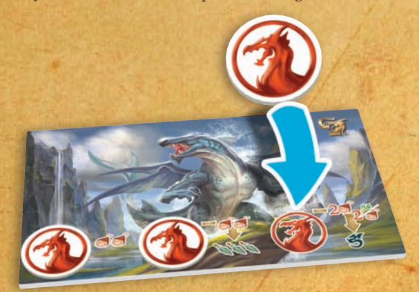
Using Dragon Ablitiy and placing Ability marker. Abilities being already full) are lost.

Any Ability markers that cannot be placed on Dragon Tiles (due to all Dragon