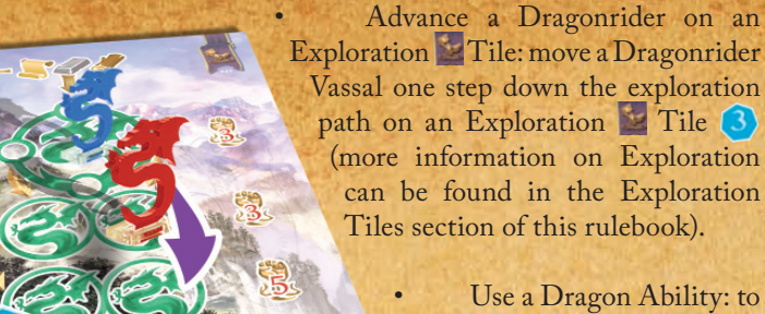
Free Action example: Advancing Dragonrider on an Exploration Tile

Place a tile in the Wilds: this Free Action may be resolved only immediately before placing a Vassal. If there are no free tile spaces in the Wilds, that player may pay 1 Weapon to remove any 1 Production, Transformation, Research, or Power Tile (but not Exploration Tile) from the Wilds. When placing a tile in the Wilds, the player immediately receives the resources depicted on the Action Space covered.