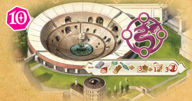
City Action Spaces: Breeding Grounds

9. Builders' Square (multiple Dragonriders): player exchanges 2 Stone for 2 Ability markers 2 2, and immediately places them on Dragon Tiles. Any Ability markers not placed are immediately returned to the stock. Please note, that an Ability marker must always be first placed on the leftmost empty Ability on any Dragon Tile (see p. 11 for more details). 9