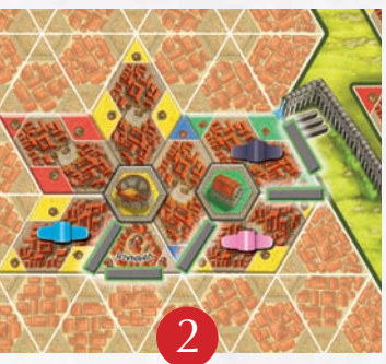
Aqueduct pieces may be placed on the touching edges of two adjacent Neighborhood tiles or on the edge of a tile next to an empty space or the edge of the board.