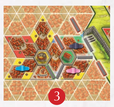
Each piece added to an Aqueduct must be added to the end of the line farthest from the Water Source vertex.