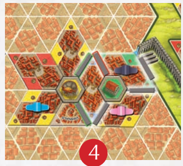
An Aqueduct can bend and twist as many times as you wish, but it can never branch or loop back upon itself.