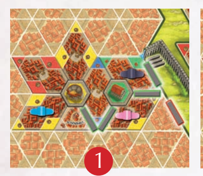
Aqueduct pieces must be placed on the edge of a Neighborhood tile.

Each Aqueduct is formed by a series of Aqueduct pieces. These pieces form an unbroken line that will wind its way through the city. When you place Aqueduct pieces on the board, you must obey these rules: