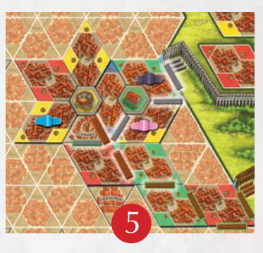
Different Aqueducts must not intersect or come into contact with each other.