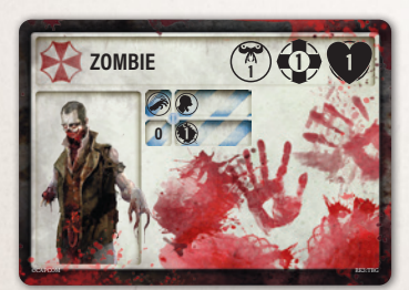
Zombie reference card