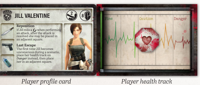
Player health track