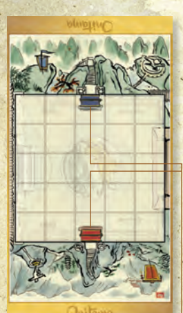
ROLLUP GAME MAT