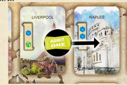
EXAMPLE: On the purple player's turn she chooses a green die from the "Harry Kellar" master space.

Since he has five acclaim cubes, he can activate both "Levitation" and "She" cards. He gains 1 flair token from the Levitation card and places it on the "She" card. He has a ticket token on the board in Liverpool. The "She" card allows him to move a ticket token from one city to another. He moves a ticket token from Liverpool to Naples. Naples gives him two more acclaim cubes. Plus, he gains one point from the flair token on the "She" card.