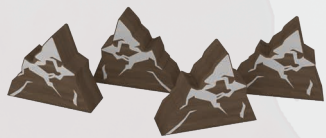
4 Mountains for connection blocking