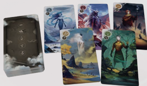
57 Biome cards (13 red, 12 green, 11 blue, 11 yellow, 10 orange)