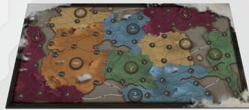
1 Double-sided map game board