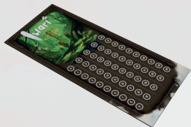
1 Score-track board