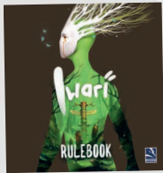
1 Game Rulebook