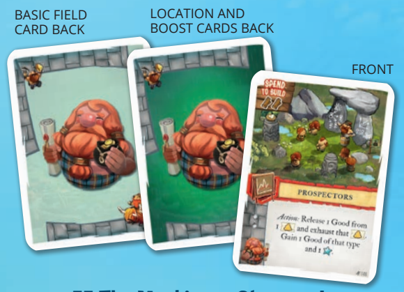
33 The Mackinnon Clan cards