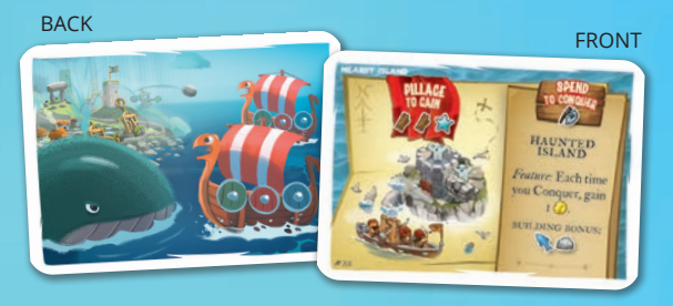
10 Distant Island cards

Each Clan has its own deck of cards. When told to draw a card from your deck, players will draw only from their own Clan deck unless stated otherwise. There are also two decks of Island cards, which all players will be able to interact with using the Sail action to either Pillage or Conquer them.