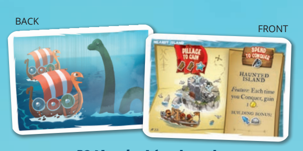
12 Nearby Island cards