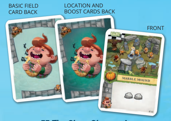
33 The Glenn Clan cards