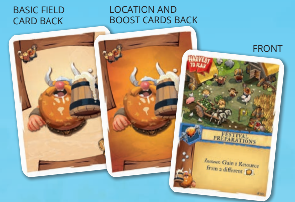
33 The Heidel Clan cards