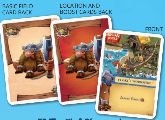
33 The Ulaf Clan cards