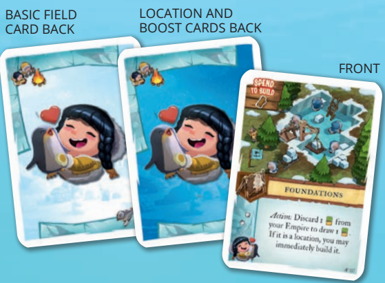
33 The Panuk Clan cards