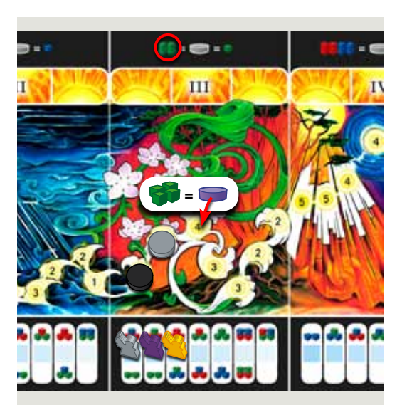
The purple player is on day III and wants to do a day's work there. He spends 4 life cubes (green) and puts a day work marker on the first empty circle, which is the third one. He'll get 4 points for this day's work at the end of the game.

A player can do a day's work on the day where he's standing if he hasn't already done a day's work there. He spends as much essence as the day work cost for that day and places one of his day work markers on the first empty circle on the day work track for that day. The number in the circle indicates how many points he'll get for this day's work when calculating the score at the end of the game. He returns the spent essence cubes to the stock.