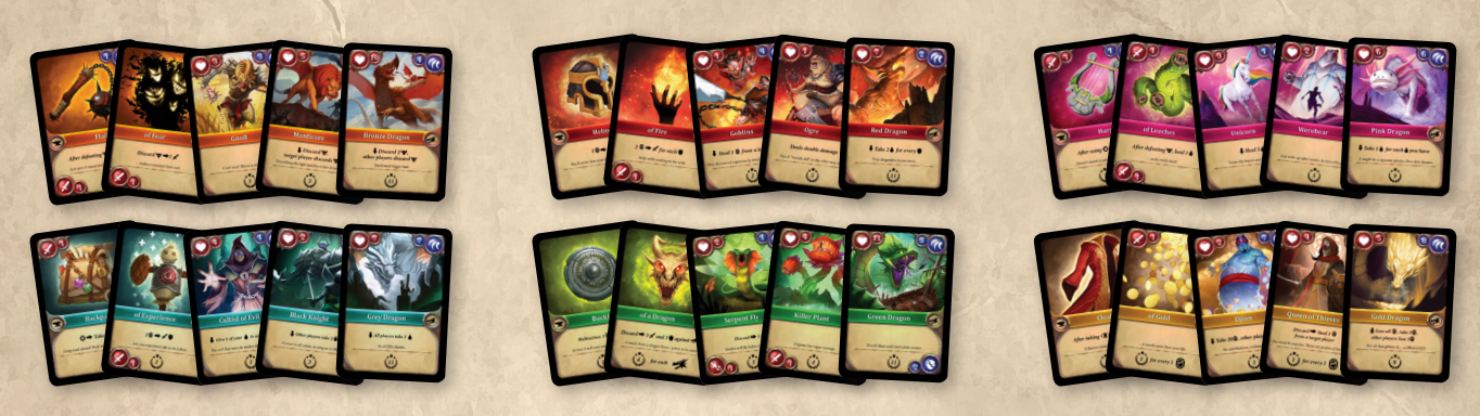
150 Kingdom Cards in 6 decks, each one consisting of 25 cards:

3 Items and 3 Enchantments (2 of each); 6 Minor Monsters, 4 Medium Monsters and 2 Major Monsters; 1 Dragon