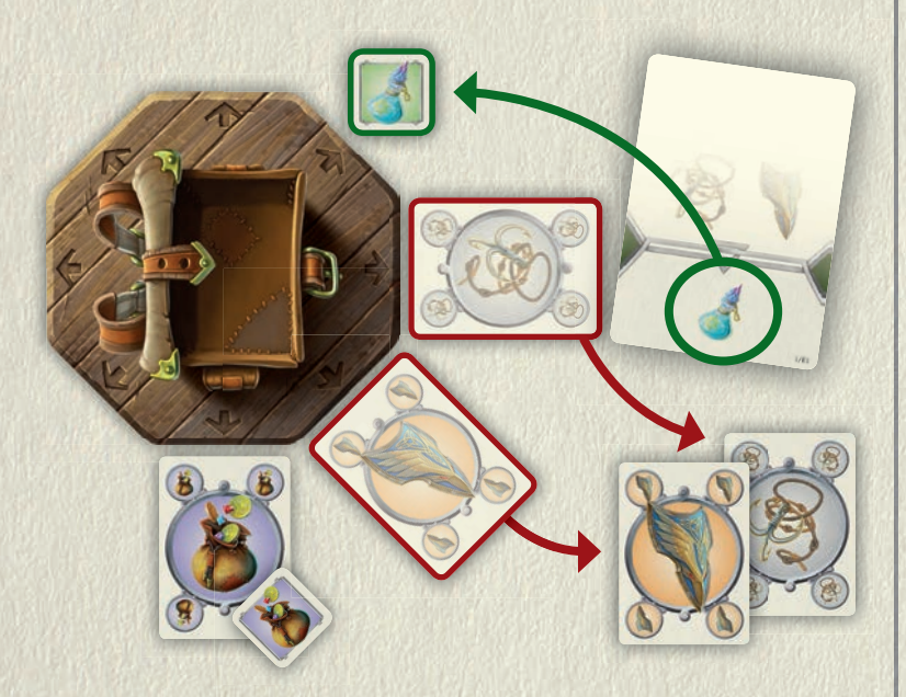
...As the Mission is successful, the two Items matching its requirements are discarded from the Backpack into the Discard pile. The Reward of the Mission is a Phial, and taking it is mandatory. There is not already any Phial in the Backpack, so a Phial Reward token is added to an empty slot.