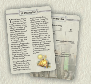
4 Adventure Scrolls