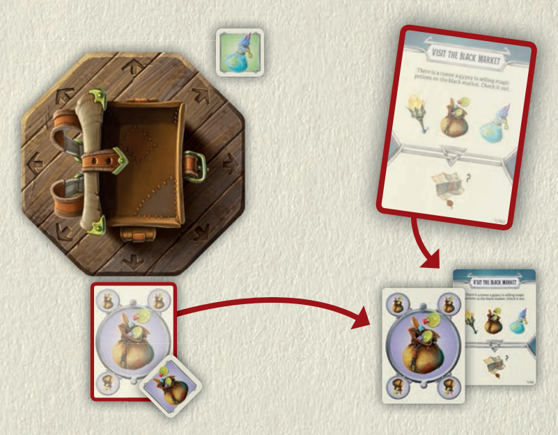
...As the Mission fails, it is discarded. The players can choose to discard one or both of the Items required by the Mission from the Backpack. They choose to discard one of the two Bag of Golds, and to keep the Phial.