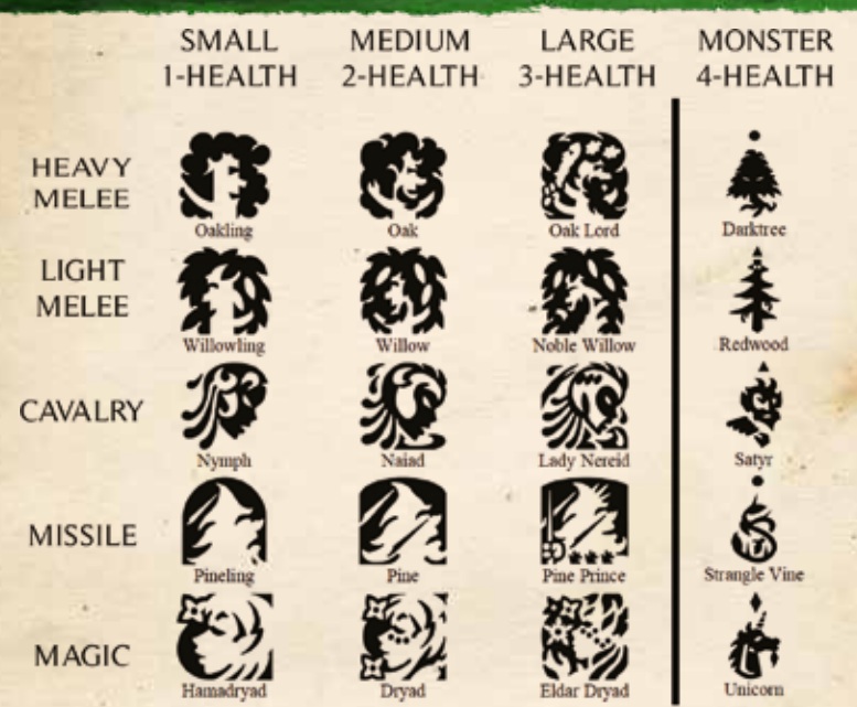
Treefolk are a combination of Green (Water) and Yellow (Earth), and so can cast those colors of magic.