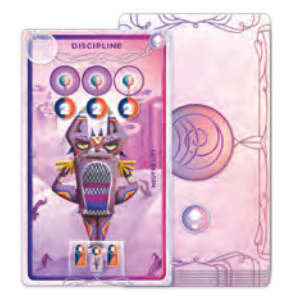
6 Balance Strong Emotion cards