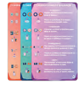
3 Balance Scoring Reference cards