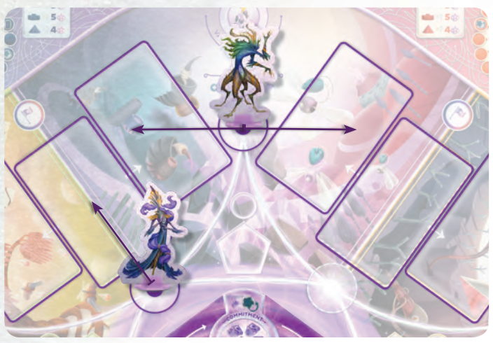
Only 1 Triad is adjacent to a Spirit Figure on a Frontier.

2 Triads are adjacent to a Spirit Figure in a Realm.