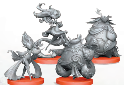
4 Bliss Spirit Miniatures