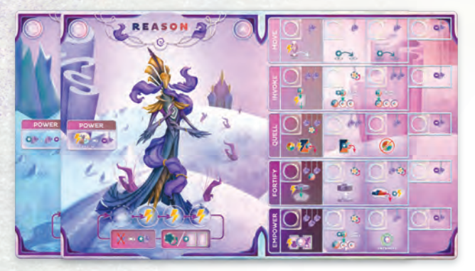
2 double-sided Balance Spirit boards