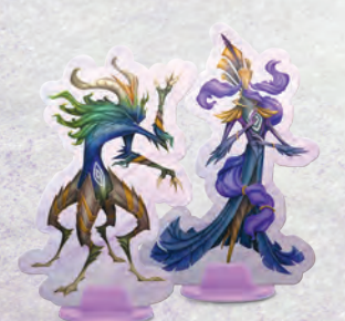
2 Balance Spirit Figures with plastic stands