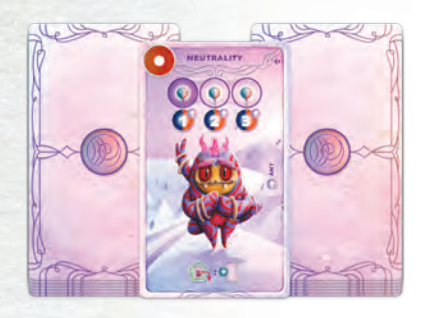
16 Balance Mild Emotion cards