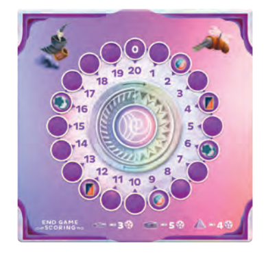
1 Wheel of Intentions