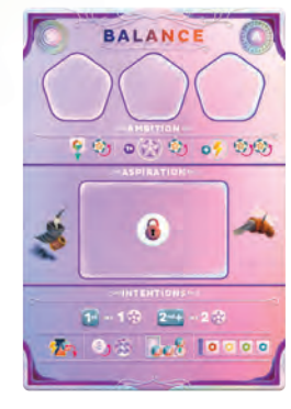
1 Balance Team board