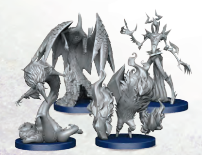
4 Gloom Spirit Miniatures