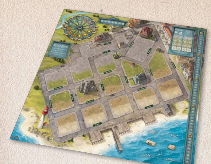
1 Game Board