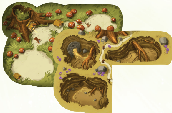
6 PLAYER BOARDS