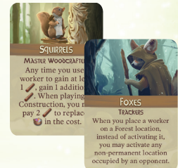
15 PLAYER POWER CARDS