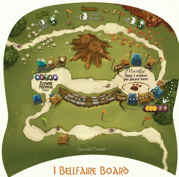
1 BELFAIRE BOARD