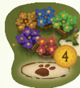
1 FLOWER FESTIVAL EVENT TILE