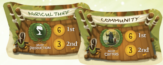
7 GARLAND AWARD TILES