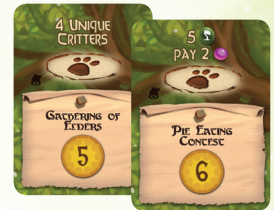
9 SPECIAL EVENT CARDS