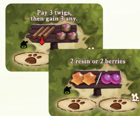
4 FOREST CARDS