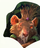
1 RUGWORT TOKEN