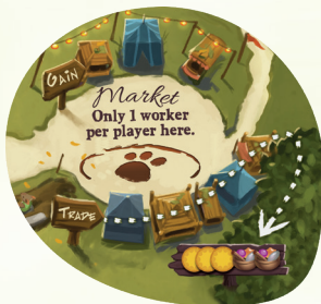
1 MARKET BOARD