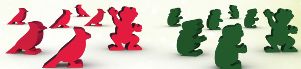
12 CRITTERS (6 CARDINALS, 6 TOADS) AND 2 FROG AMBASSADORS*