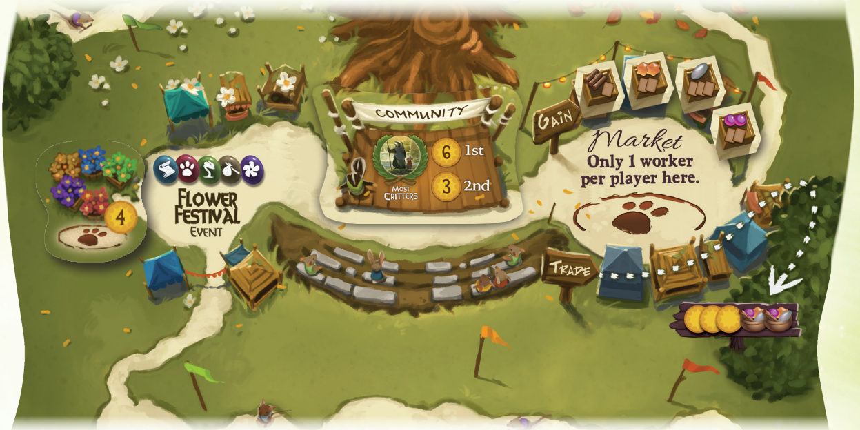
Bellfaire board set up to play with the Flower Festival, Garland Awards, and Market modules.

The Bellfaire board contains the Market location, and spaces for the Flower Festival Event and Garland Award tiles.