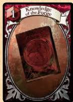
Knowledge of the Forge