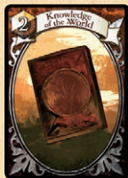
Knowledge of the World