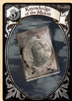
Knowledge of the Moon

You can obtain Fragments of Ancient Knowledge by visiting specific Frontiers or trading with other players. You cannot have more than one copy of each Fragment. If you end your move on a Dark Forest while in possession of all eight Fragments, flip over that Dark Forest.