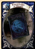
Knowledge of Magic