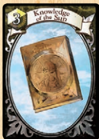
Knowledge of the Sun