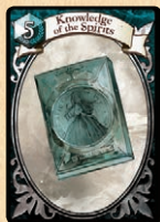
Knowledge of the Spirits