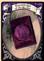
Knowledge of the Ruler