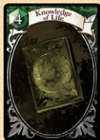
Knowledge of Life