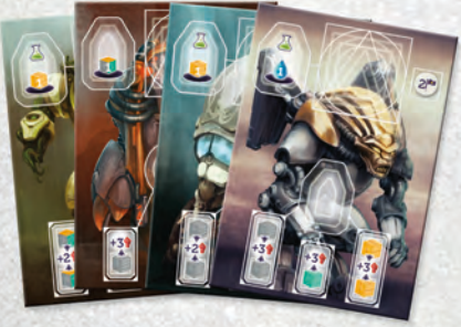
18x Adventure cards (10+♦)