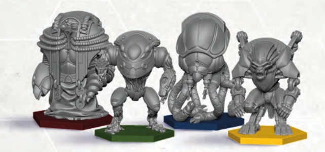
4x6 Exosuit miniatures